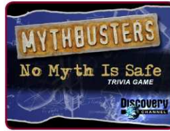
Discovery Channel - MythBusters