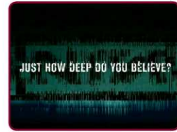
Nine Inch Nails - With_Teeth Album