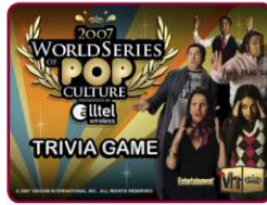
VH1 - World Series of Pop Culture