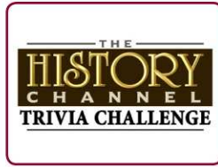
The History Channel