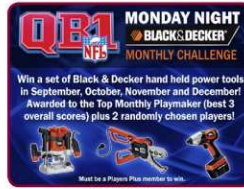
Black and Decker