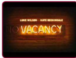
Boost Mobile/ Sony Pictures - Vacancy