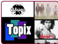
Warner Music - The Doors