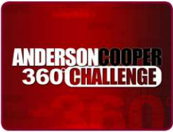
CNN - Anderson Cooper